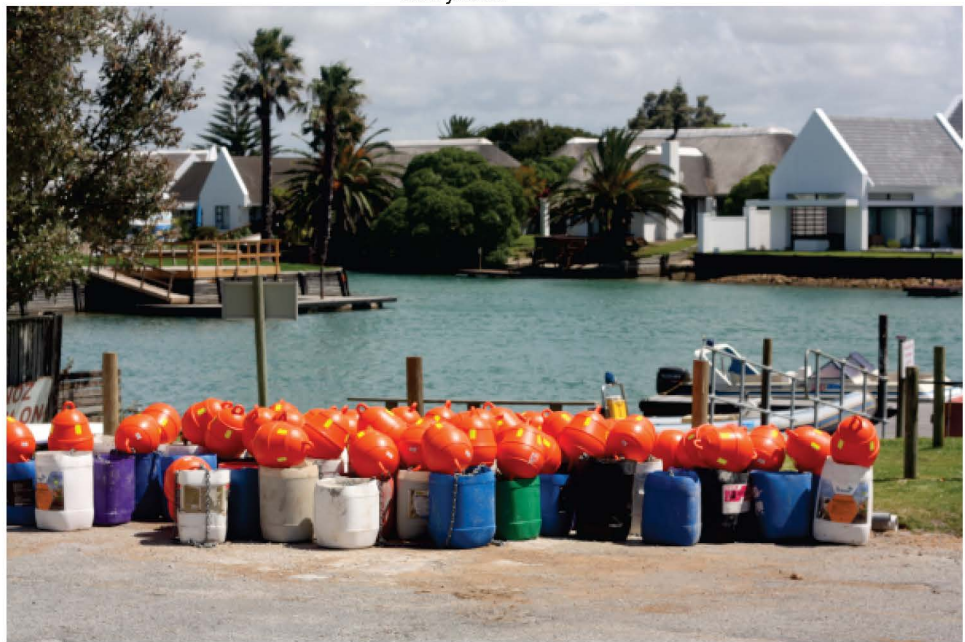
Buoys ready to be placed on Kromme River